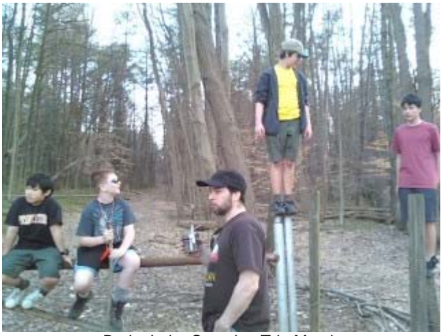
Burke Lake Camping Trip March