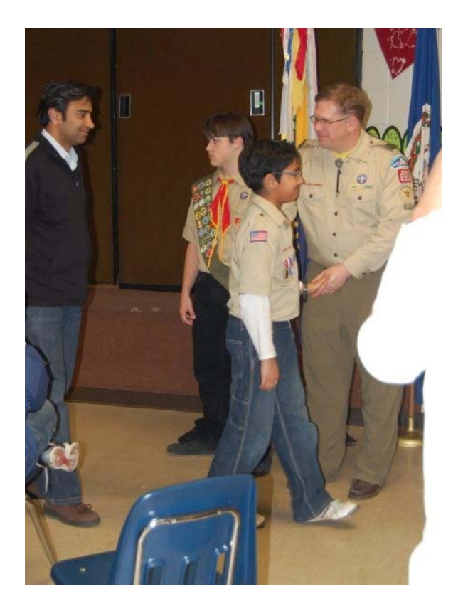
Blue and Gold Cross-Over Ceremony