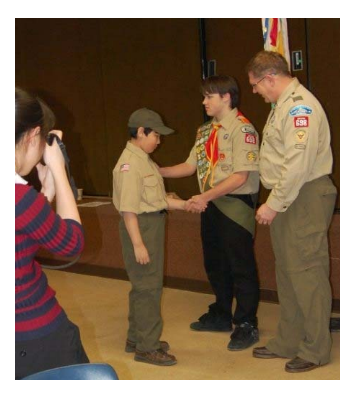
Blue and Gold Cross-Over Ceremony