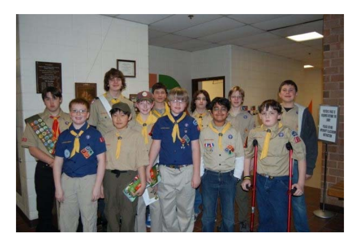
Blue and Gold Cross-Over Ceremony